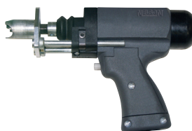
NS 40 SL Short cycle process