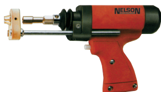
NS 40 B Drawn arc process