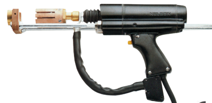
NS 20 BHD "Heavy Duty" Drawn arc process